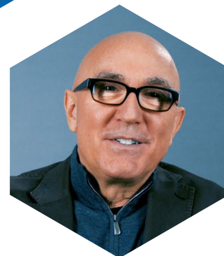
Prof. Stuart Schreiber