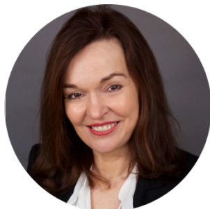
Prof. Dame Carol Robinson University of Oxford